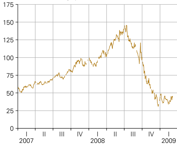
Price of Oil West Texas Int, $/bbl