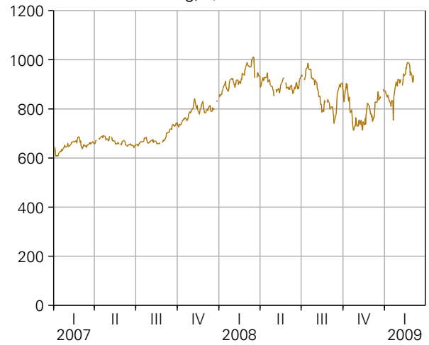
Price of Gold London PM Fixing, $/oz