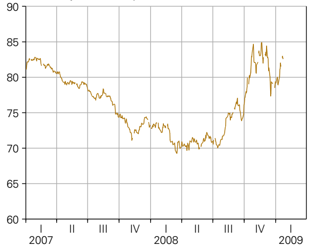
U. S. Dollar Exchange Rate FRB Major Currency Index, 1973 = 100