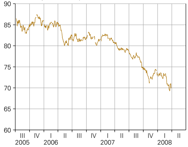
U. S. Dollar Exchange Rate FRB Major Currency Index, 1973 = 100