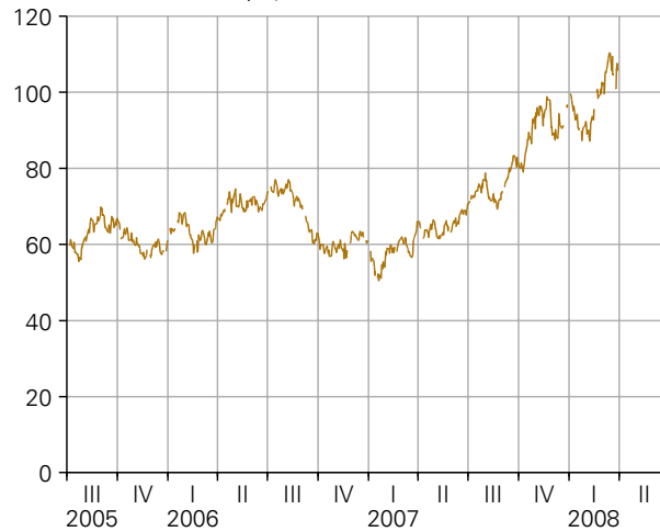
Price of Oil West Texas Int, $/bbl