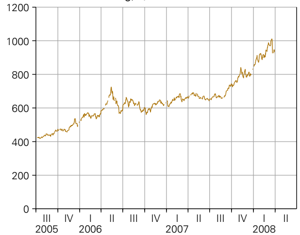
Price of Gold London PM Fixing, $/oz