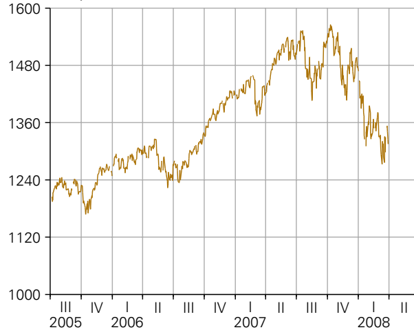
S&P 500 Stock Prices Daily Close, Index 1941-43 = 10